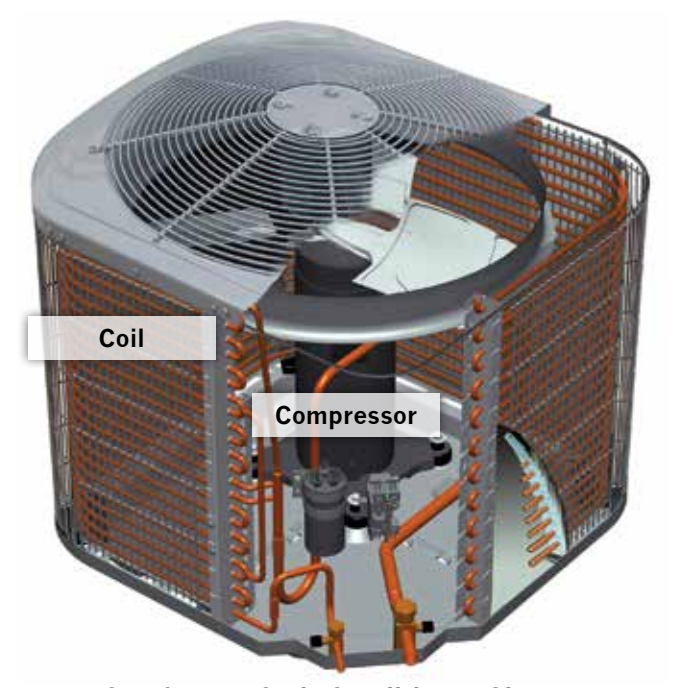
Comfort™ 16 Air Conditioner Shown