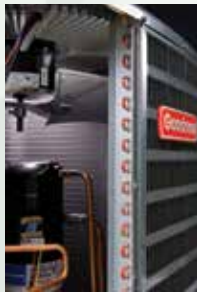
The use of Goodman’s SmartCoil 5mm tube condensing coil design optimizes the heat transfer ability of R-410A refrigerant compared to standard 3/8” copper tubing.

When properly matched and installed, your Goodman brand SSX14 Air Conditioner delivers a performance up to 15 SEER. Air conditioners with higher SEER represent more energy-efficient operating levels compared to lower SEER units. In short, as the SEER increases so does the unit’s energy efficiency rating. In many applications, the efficiency of your air conditioner can be enhanced by using it in conjunction with a Goodman brand variable-speed gas furnace.